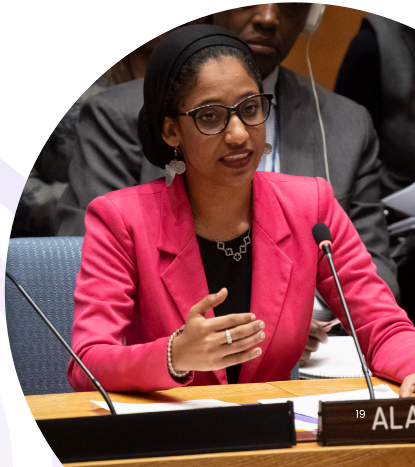
Right: 29 October 2019. Alaa Salah, civil society activist and community leader, addresses the Security Council meeting on Women and Peace and Security.

LGBTIQ CSOs looking to engage with the WPS agenda at the UN level should reach out to Outright International with any questions. Outright is eager to amplify your communities' voices.