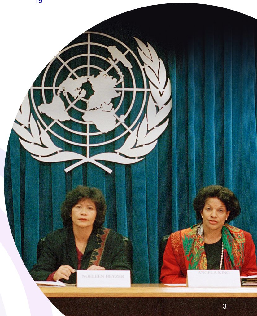
Cover photo: UN Photo/Manuel Elias, 25 October 2018. Security Council Meets on Women, Peace and Security.