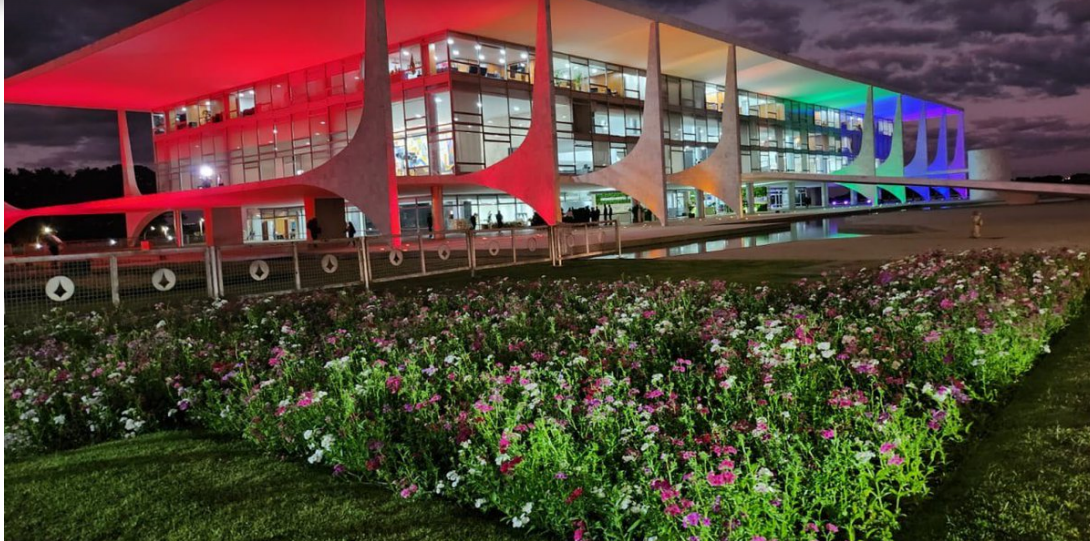
Brazil's Planalto (Presidential) Palace illuminated in rainbow colors in honor of Pride month.