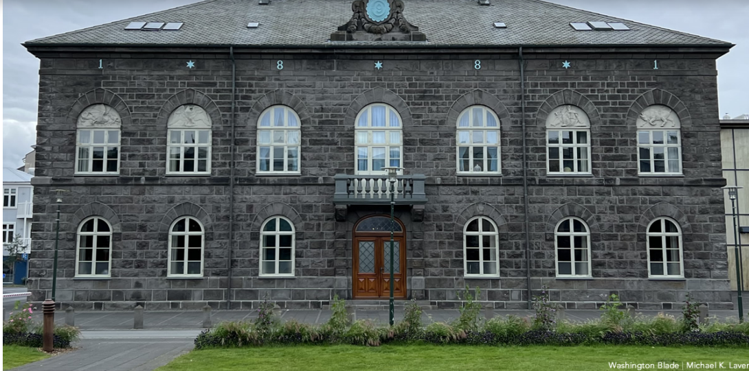
The Icelandic Parliament in Reykjavik, Iceland. The country has banned so-called conversion therapy for minors.

Edgars Rinkēvičs in June became Latvia's first openly gay president. Spanish lawmakers in February approved a landmark transgender rights law that allows anyone who is over 16-years-old to legally change their gender without medical intervention.