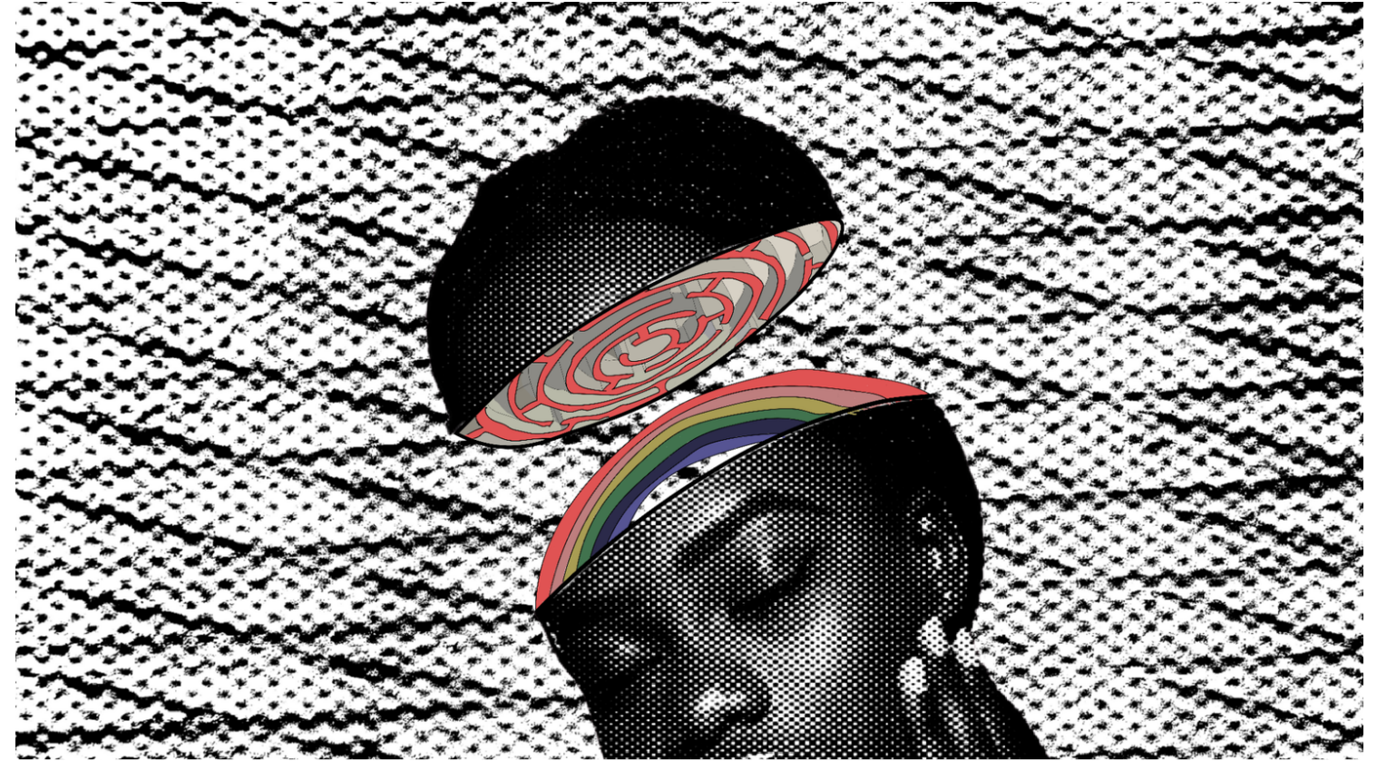
Illustration: Inge Snip

he effectiveness of US bans on anti-LGBTQ 'conversion therapy' has been called into question after mental health professionals recommended by a prominent US religious conservative group offered to "remedy" an undercover reporter's "unwanted same-sex attraction".